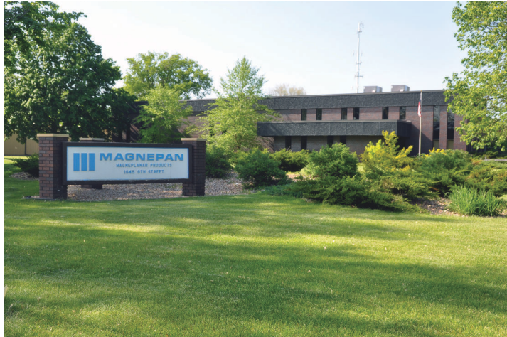
Magnepan factory in White Bear Lake Minnesota.

enable the drivers to match the light speed movement of electrons from an amplifier. Because Magneplanar drivers are ultra-low mass, thin-film designs, they are as close to zero mass as is physically possible. The most subtle, nuanced signal from the amplifier will cause the low-mass ribbon to respond and resolve nuances that other loudspeakers obscure. The Magneplanar true-ribbon element used in the 30.7, 20.7 and 3.7i tweeter element is one-tenth the thickness of a human hair. It is so light that when a piece of it is dropped from a height of six feet it takes an average of five seconds for it to reach the floor. With such fragility, only by driving the transducer over its entire area can materials of such low mass be used.