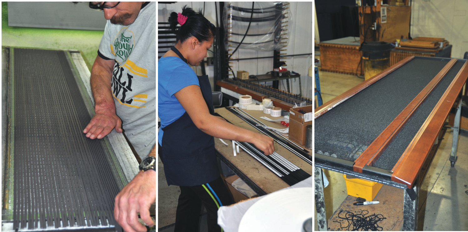
Magnet structure of a Magnepan panel.