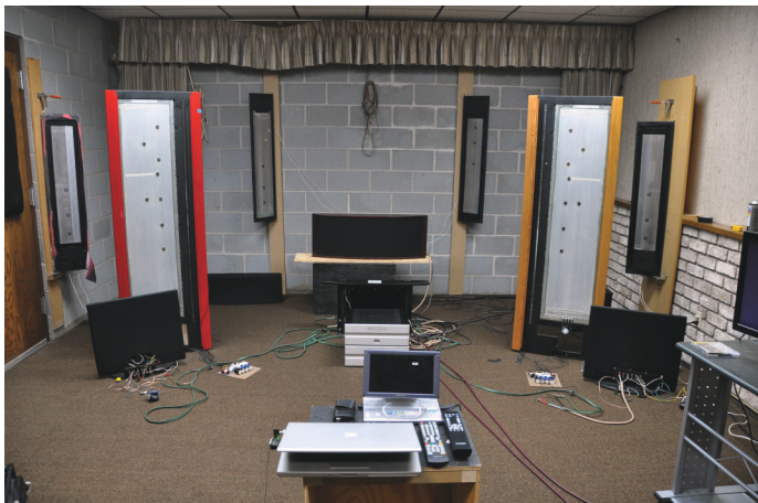
Design and listening room at Magnepan showing the 3.7s, Tri-Center And DWMs.

I was first attracted to the idea of using Magneplanar loudspeakers with the introduction of the new Magneplanar 1.7 model at the 2010 T.H.E. Show during the International Consumer Electronics Show (CES), as reported in Issue 146 (January/February 2010). The Magneplanar 1.7 (now the 1.7i) is a three-way design, with a woofer, tweeter, and super-tweeter. The new “i” model is designed, for the first time, with “full-range” quasi-ribbon technology down into the lower mid-range and bass, as well as for the super-tweeter. The quasi-ribbon driver is a deviation from Magnepan’s true-ribbon design. A very thin film backing is used to hold the delicate ribbons in place, whereby the super-thin strips of Mylar-backed ribbon foil are suspended in a magnetic field. One of the advantages of quasi-ribbon drivers is extremely wide-frequency bandwidth and high-power handling. The result in the 1.7i is low distortion and seamless ribbon clarity. As reported, the sound was amazingly coherent, clear, and effortless. I was immensely impressed by the wonderfully realistic articulation and fullness of the sound and the revealing inner resolution.