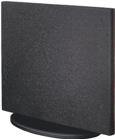
DWM Bass Panel

Deep sub-40 Hz bass is extremely demanding at lifelike sound levels and would require an extremely large full-range planar surface area to accurately reproduce. The Magneplanar 20.7 is up to that task, as well as the new flagship 30.7. Still, when using Magneplanars in a home theatre context, a powered, sealed-enclosure subwoofer(s) with very quick and agile transient response should be used to extend the low-frequency SPL intensities that can be present in motion picture soundtracks. To the extent possible, the transient response of the subwoofer(s) should complement the fast response of the Magneplanars for the best possible integration and sense of “musicality.” While Magneplanars are fully capable of reproducing the upper bass, midrange, and high-frequency intensities found in car crashes, explosions, and gun shots at reference sound-pressure levels set by the motion picture industry, a subwoofer(s) is necessary to assure that the powerful low end of the spectrum can be dynamically reproduced via the .1 LFE at the same reference sound-pressure levels. Of course, this is true for conventional dynamic loudspeakers whose response is limited below 40 Hz.