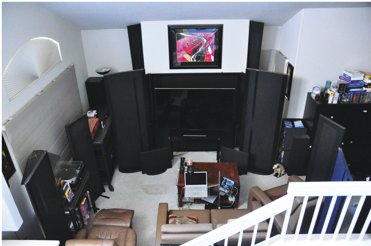
Editor Gary's Reference System.

The other equipment in the system complementary to the Magnepan loudspeakers and Classé Audio amplifiers are, as mentioned, a Trinnov Audio Altitude32 AV Preamplifier, which supports the Auro-3D, Dolby Atmos and DTS:X Immersive Sound formats, OPPO BDP-205 Universal UHD Blu-ray Disc Player, and Wireworld Platinum Starlight HDMI, Loudspeaker and Interconnect Cables. The Altitude32 allows me to select or mute any channel for evaluating signal presence and amplitude in each channel.